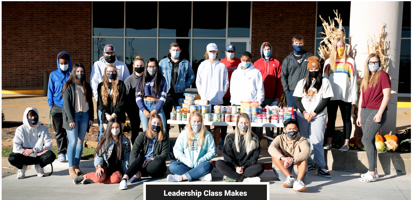
Leadership Class Makes Large Donation to Food Pantry